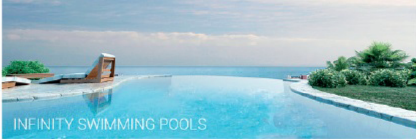
INFINITY SWIMMING POOLS

Designed for year-round leisure and enjoyment.